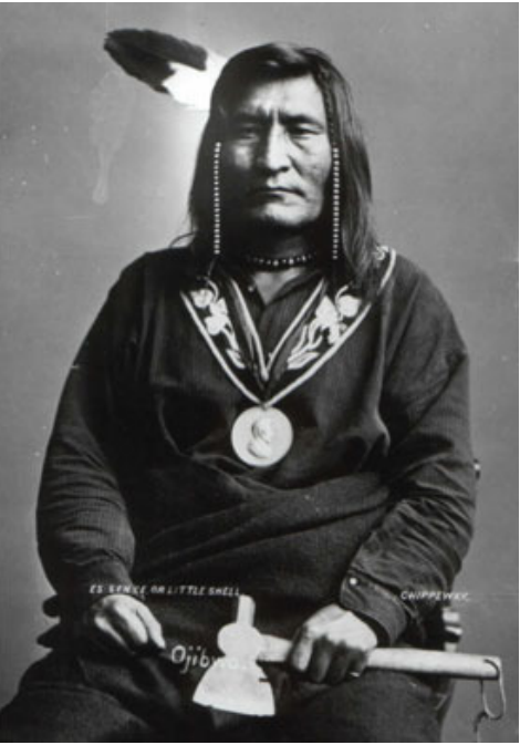
Chief Little Shell III

After waiting since 1849 for the United States Government to provide land title, compensation for Aboriginal rights or a Reserve, 500 Metis men under the leadership of Chief Little Shell took action against settler squatters at Turtle Mountain in 1882. The article which follows is from the Winnipeg Daily Sun , July 29, 1882 (page 7).